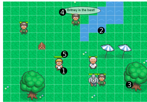
Figure 2. Freedom of Speech — A debating adventure game built from Parts.

Each feature of the game is implemented on basic Morphs in one of three ways: functionality that is required once, belongs to one object. If functionality is required on various different Morphs, however, we implemented it on a central