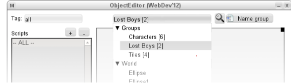
Figure 4. Our Object Editor shows a list of available groups.

For the direct selection, the editor provides a tool ① to enter selection mode , in which developers define groups by clicking on the visual representation of objects. Furthermore, we modified the edit button of Lively’s selection tool to open our editor on the selected morphs. To select from the scene-graph, we added a tree-view ② that shows the composition hierarchy of the world. Developers can browse the scene and click to select. For programmatic selection, we modified the global function edit , which opens an editor on the argument, to treat collections of targets as a group. The global edit function is also invoked by Lively’s shortcuts, providing convenient access. Furthermore, since group names are just properties of objects, any program can also filter objects with